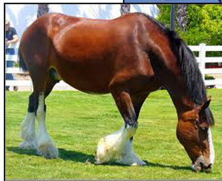
Warm Springs Ranch, home for more than 100 Clydesdales.

Enjoy a guided tour through the 25,000-square-foot breeding facility and 300 plus acres of pastures that together make up the headquarters for the Budweiser Clydesdales. The tour allows guests to meet and interact with foals, mares, and stallions and get a close-up look at the custom-made equipment used to care for and transport the ever-popular Clydesdales.