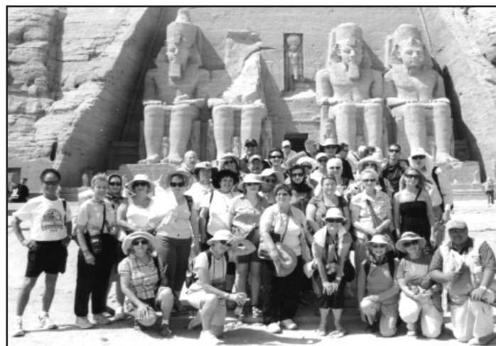
Trip participants gather at Abu Simbel for a group photograph.

On September 25 "riders" saddled up for a two-day Pony Express trip in honor of the 150th anniversary of the start of the Pony Express. The trip, led by Jackie Lewin and Kathy Reno included stops at Pony Express Stations and other attractions along the trail.