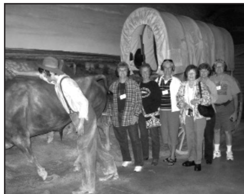
Pony Express trip participants get ready to explore the Great Platte River Road Archway Museum.

816.232.8471 www.stjosephmuseum.org Become a Facebook fan © 2010 St. Joseph Museums